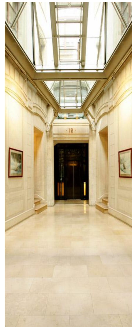
Banque Privée Edmond de Rothschild, Rue de Hollande.